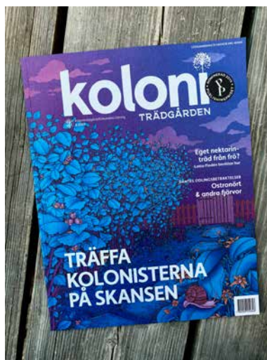
Hazel (Corylus avellana) hedge at nighttime Illustrator Fredrik Brännström