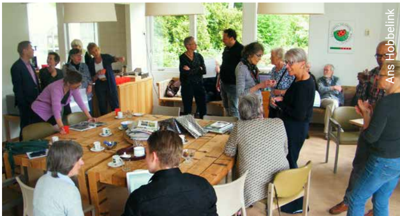
Neighbourhood residents and allotment gardeners discuss together in the association house about a better access to the garden park for older people.

member of the AVVN board and allotment gardener in Utrecht