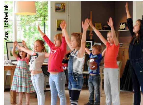
Children of allotment gardeners and from the neighbourhood in the clubhouse practising a dance.