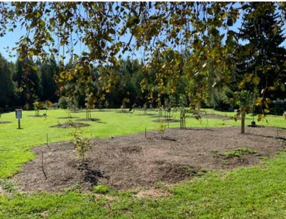
Newly planted arboretum with 70 trees and shrubs.

So far in 2021 we are plus three on new member associations and a growing number of our members have started working on the Environmental programme.