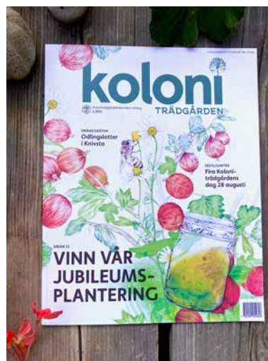
Cloudberries Illustrator Lina Ekstrand